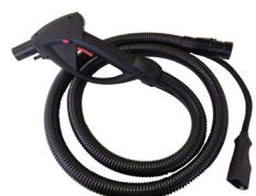
2.5 Metre Steam, Detergent & Vacuum Hose