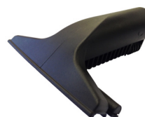
150mm Steam & Vacuum Brush Nozzle