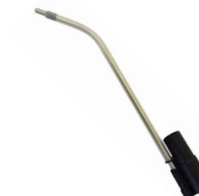
Long Steam Lance