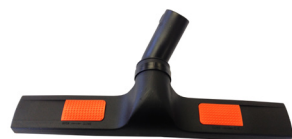
300mm Floor Nozzle