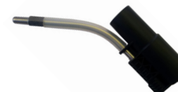
Short Steam Lance