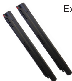
Extension Tubes x 2 supplied with each machine